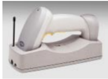
The LS 4071 in its cradle/base station.

recharging cradle/base station, which communicates with your host computer through Synapse cables or direct connection.