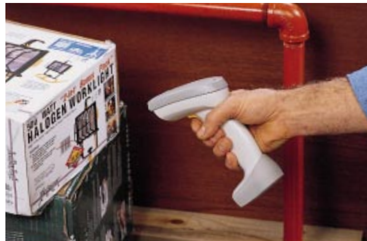
The LS 4071 cordless scanner is ideal for scanning items too heavy or bulky to place on the checkstand.